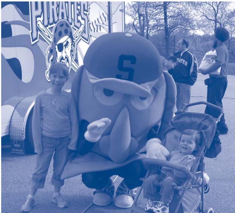
Children of all ages enjoyed Ballpark Express, an evening of games, prizes and ballpark food, held on the South Office property. The event was part of the KDKA NewsTalk Radio's Hometown Salute and was held in conjunction with the Pittsburgh Pirates and KDKA Radio.

*Names have been changed for confidentiality