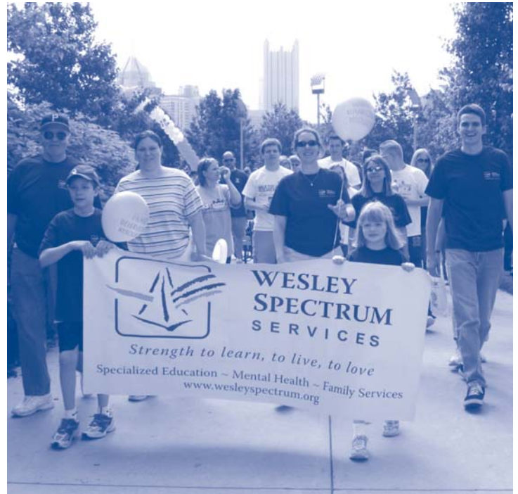
The Wesley Spectrum team proudly supported the NAAR Walk for Autism Research, held at Heinz Field. Sixty-seven walkers on our team joined the thousands of other walkers to raise over $600,000 for autism research.

The PST uses improvement tools such as logic models and process maps, business reviews and business plans to find solutions to problems, to provide assistance in setting up new programs/processes, and to help create a road map for new and current staff. These tools enable staff to work towards the same goals and objectives, ultimately improving their service to children and families. ♥