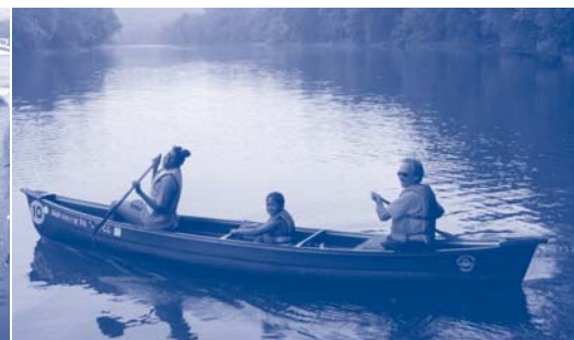
Westmoreland County Day Camp